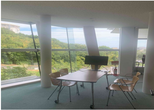
A6IP Office @ IGES HQ (Japan)